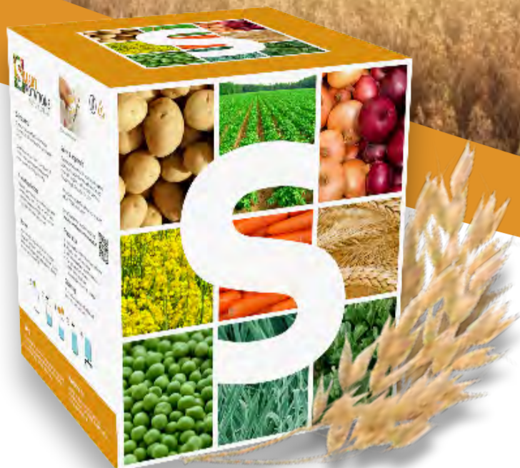
SR3 Oats treats 5 Hectares