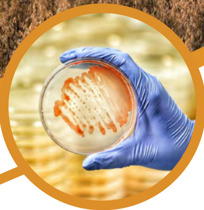
Tailored bacteria to improve oats production

SR3 Oats comprises four species of Plant Growth Promoting Rhizobacteria (PGPR) and a special organic biostimulant that encourages microbial multiplication.